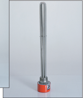
Screw Plug Heater