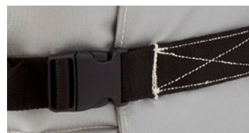
Fits several tote tank sizes with adjustable nylon straps and buckles