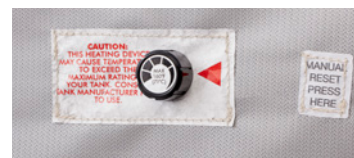
Controls temperature easily with adjustable thermostats