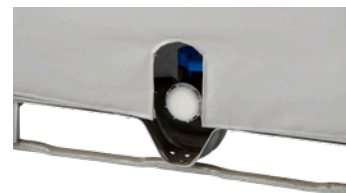
Mouse hole in provides easy access to spigot