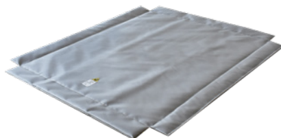
Optional Insulating Cover

Insulation thickness of top cover: 0.25 in (6 mm)