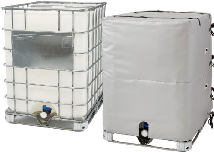
Original Wrap-Around Tote/Tank IBC Heaters page 5-17