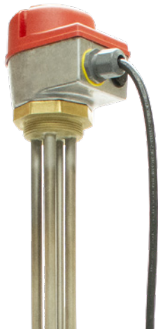
NEW IBC/Tote Tank Immersion Heaters page 5-21