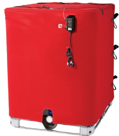
NEW Wet-Area Wrap-Around Tote Tank/ IBC Heaters and Insulators page 5-19