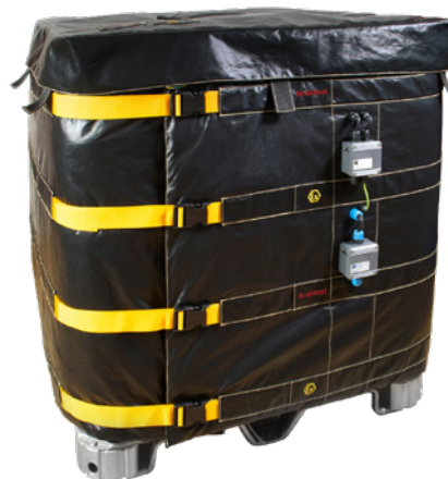
NEW ATEX Approved Wrap-Around Tote Tank/IBC Heaters page 5-22